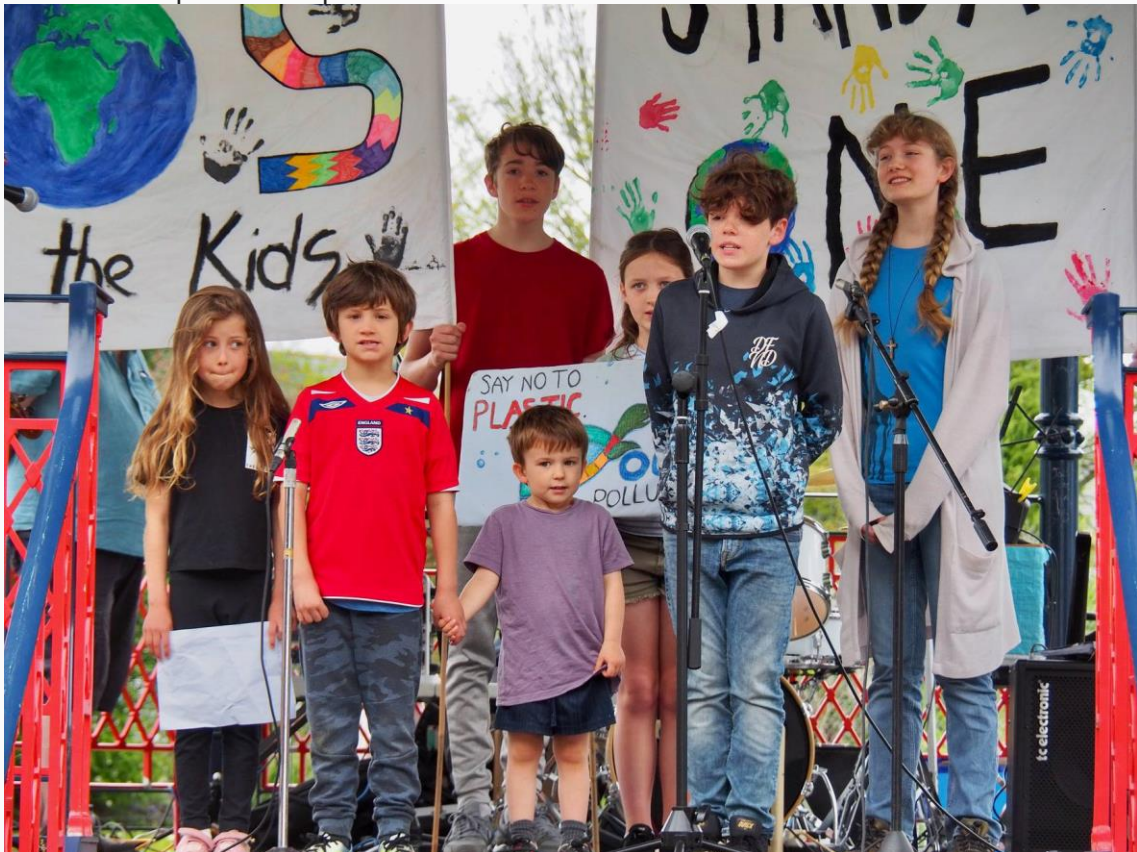
SOS from the Kids - performing at the Alton Eco Fair last July.

We will have children's art works on display and invite people to play our zero carbon board game, calculate their own carbon footprints and talk about what we can all do to reduce our impact on the planet.