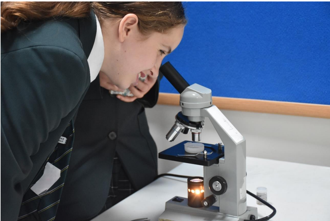
Students examine microscopic waterborne life

For more information about the work of Young ACAN, visit our website at www.https://altonclimatenetwork.org.uk/