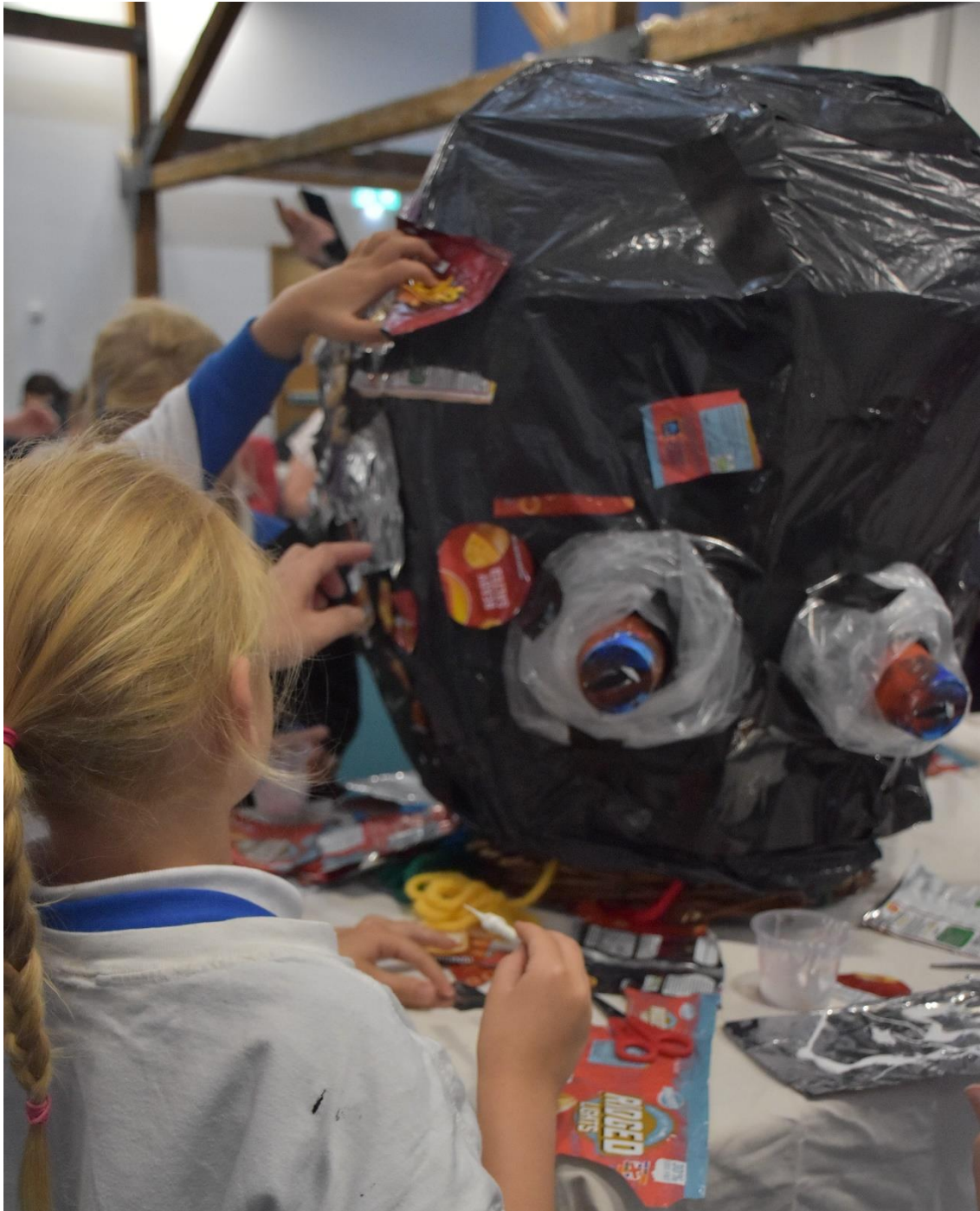
Making models at a workshop on recycling plastic